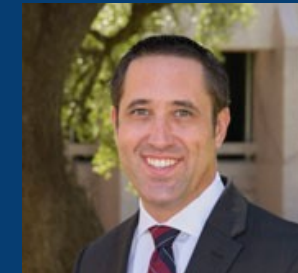
Glenn Hegar Comptroller of Public Accounts